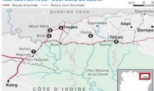
AXE ROUTIER AVEC "COUPEURS DE ROUTE"