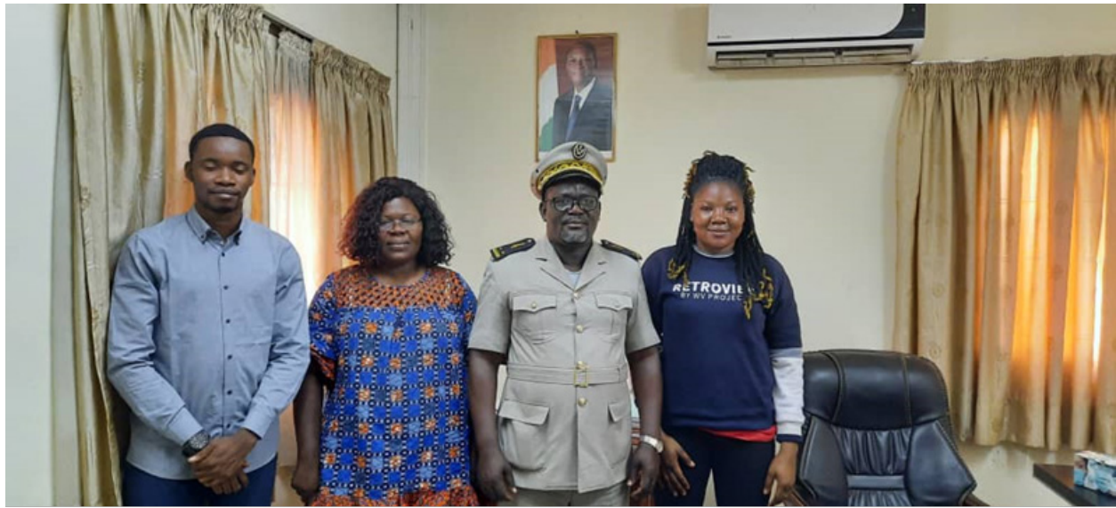
Interview with the secretary general of the Prefecture of Ferké