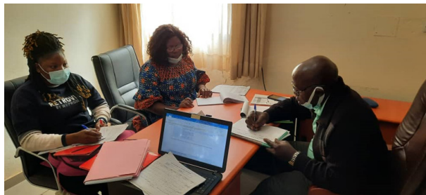
Interview with the Civil-Military Cell (CCM) of Ferké