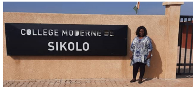
Visit to Sikolo College