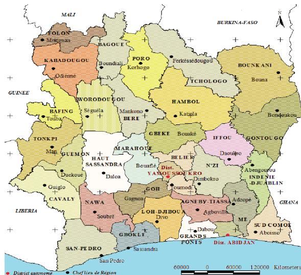
Figure 1: Map of Côte d'Ivoire

The intervention area of the R4P project (and the PEA study) includes all of the regions along the northern border with Mali and Burkina Faso. The targeted regions are: