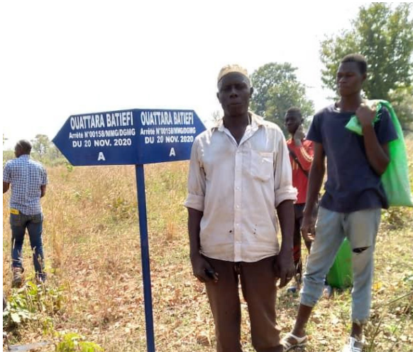
Visit of an artisanal mining site in Kong